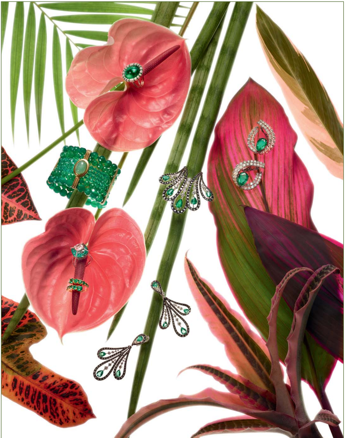
Counterclockwise from top: MARTIN KATZ white gold, emerald and diamond ring set with one oval emerald at the centre; SIFANI LONDON gold-plated silver and green agate cuff; BOGHOSSIAN white gold, diamond and emerald ring set with a central cushion-cut diamond; ARA VARTANIAN yellow gold and emerald ring; DAMIANI Vanità earrings and ring in white gold set with black and white diamonds and emeralds; ADLER white gold, emerald and diamond Le Printemps earrings; opposite, clockwise from top: SUSA BECK yellow gold earrings set with pearls, tourmalines, brilliant-cut diamonds and green amber stones; PIPPA SMALL yellow gold and tourmaline Double Greek ring; TESSA PACKARD white gold Pear Drop earrings set with diamonds, peridot and green jasper; AMRAPALI yellow gold, diamond and emerald earrings; RODNEY RAYNER yellow gold and tsavorite earrings seen at Talisman Gallery; MOUSSAIEFF white gold, diamond and emerald bangle