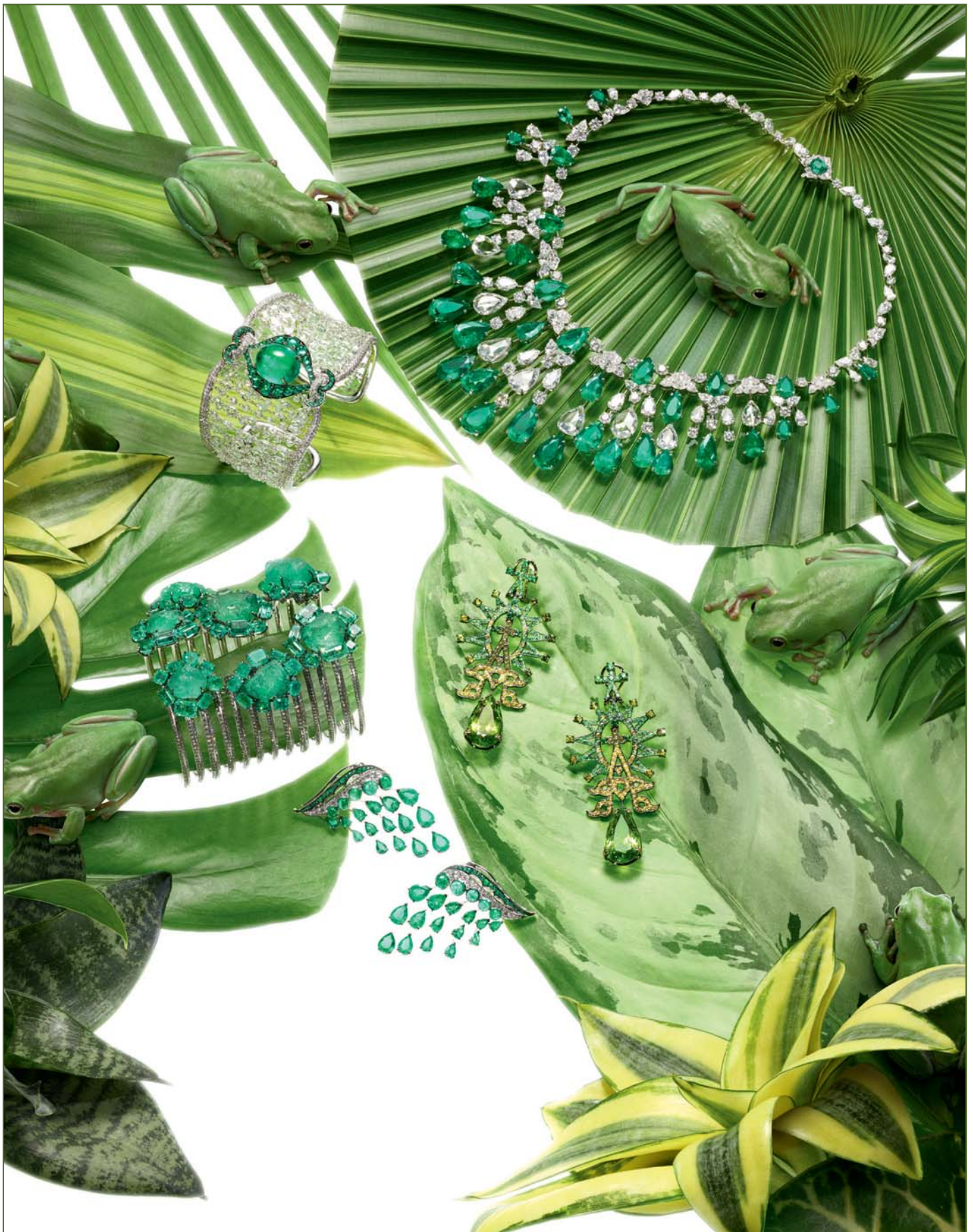
Clockwise from top: DAVID MORRIS white gold, diamond and emerald necklace; LYDIA COURTEILLE Queen of Sheba earrings set with yellow sapphires, tsavorites and tourmalines; VANLELES white gold and diamond Legends of Africa earrings set with Gemfields emeralds; GLENN SPIRO white gold and titanium cuff set with diamonds and emeralds; white gold, diamond and emerald bracelet; opposite, clockwise from top: DE GRISOGONO white gold Chiocciola ring set with emeralds, peridots, diamonds and tsavorites; CHAUMET white gold Joséphine Aube Printanière ring set with diamonds and a single emerald; DIOR JOAILLERIE white gold Rose Dior Bagatelle ring set with diamonds, tsavorite garnets and emeralds; BOODLES platinum, diamond and emerald Greenfire earrings; GRAFF DIAMONDS white gold and platinum, diamond and emerald Carissa earrings