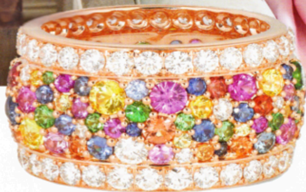
LEFT: Legend of Africa, 18ct white gold, diamond and sapphire multicolour ring BELOW: Enchanted Garden, 18ct white gold, diamond and sapphire earrings