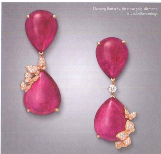
Dancing Butterfly. 18ct rose gold, diamond and rubellite earrings

A true reflection of her personal style and in homage to her first and last name, VanLeles atelier strikes the perfect balance between feminine and chic