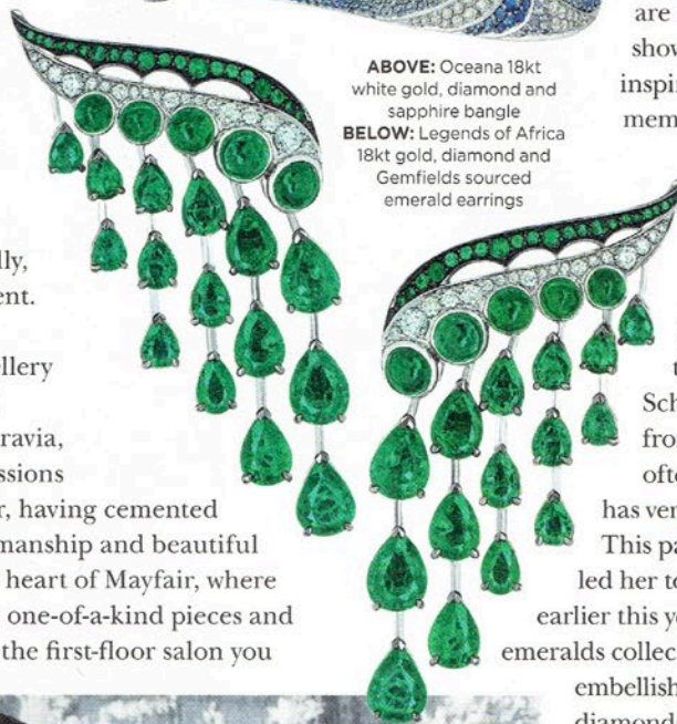
BELOW: Legends of Africa 18kt gold, diamond and Gemfields sourced emerald earrings