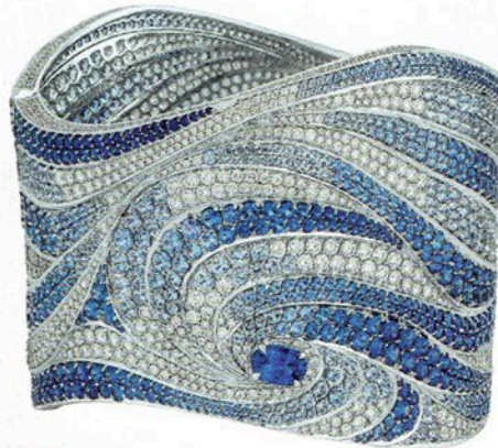
ABOVE: Oceana 18kt white gold, diamond and sapphire bangle