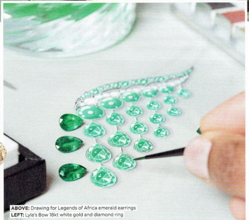
ABOVE: Drawing for Legends of Africa emerald earrings LEFT: Lyla's Bow 18kt white gold and diamond ring